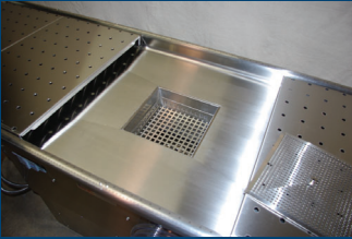
Double Cone Downdraft