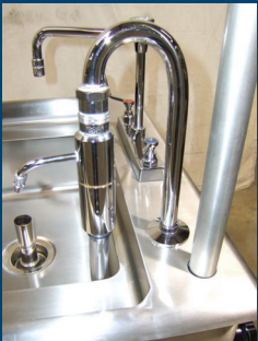
Hydro-Aspirator with Reverse Flow Rinse