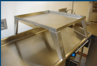
SR999 Over Table Instrument Tray