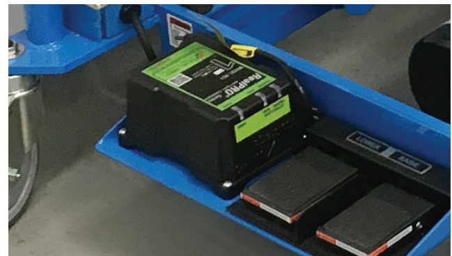
Foot pedal controls and battery charger